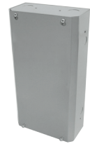
Shown With Cover