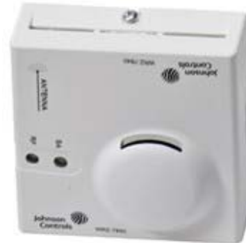
Figure 1: WRZ-7860-0 Receiver for One-to-One Wireless Room Sensing Systems

The WRZ-7860-0 Receiver uses direct-sequence, spread-spectrum RF technology, and operates on the 2.4 GHz Industrial, Scientific, and Medical (ISM) band. The receiver meets the IEEE 802.15.4 standard for low-power, low-duty cycle RF transmitting systems. A WRZ-7860-0 Receiver operates as a transceiver, to create a bidirectional association with a WRZ Series Wireless Room Sensor.